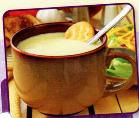
Unusual serving ware

Snap reference photos for your next party! Photograph each dish as it comes out of the kitchen. Later, attach the photo to the recipe, along with notes about what worked and what you could improve.